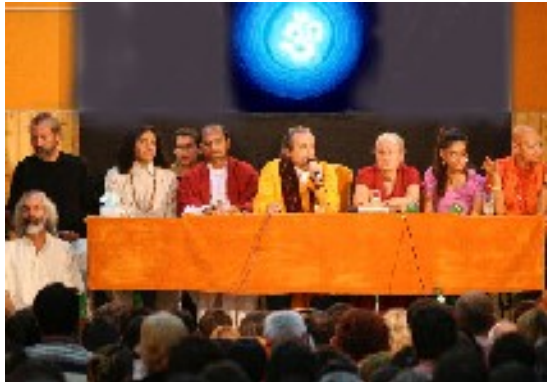
Relators in Bucharest 2005

In the Chaos, Order In the Diversity, Unity